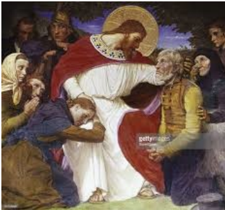
Jesus Comforts His People