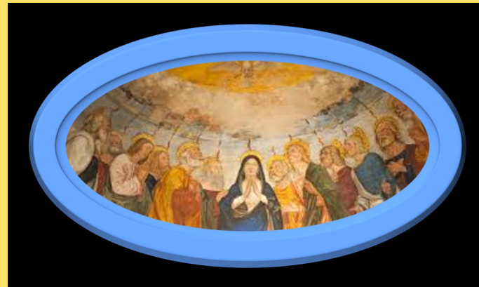
Our Lady with the Apostles and Disciples at Pentecost