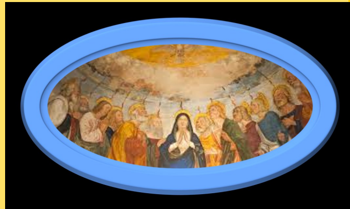
Our Lady with the Apostles and Disciples at Pentecost